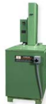
MIJI LIF 24 - 1X