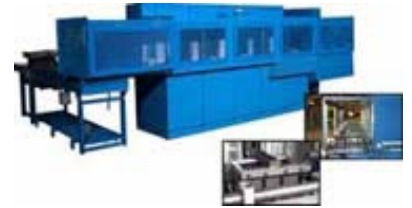
Multi-Stage with Automatic Load Transfer