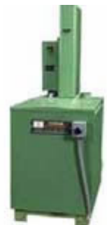
Stand Alone Unit