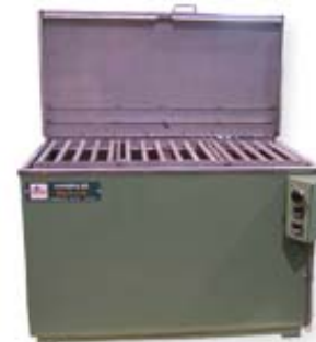
MIJI LIF 24 - 2X

3923 OAK HILL ROAD MARIETTA, NEW YORK 13110 USA