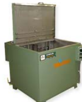
MIJI LIF 24 - 1.5X

Click here to download our Adobe Acrobat Miji Lif 24 1.5X Data Sheet.