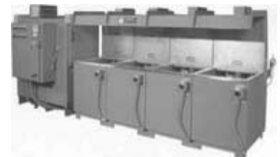
Multi-Stage with Manual Load Transfer